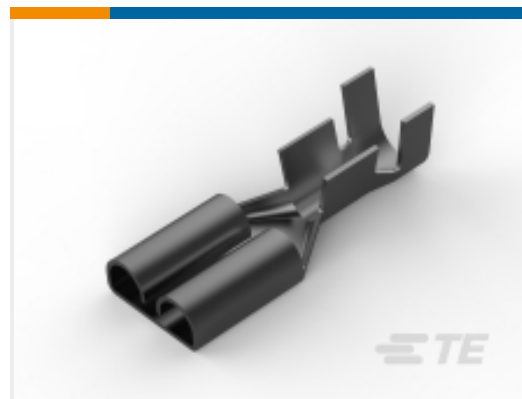
TE Part # 170258-2 FF 250 REC 14-12AWG TPBR REREELING