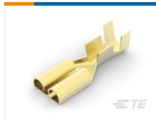
TE Part # 170258-1 FF 250 REC 14-12AWG BR REREELING