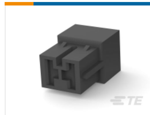
TE Part # 280543-5 FF 250 REC HSG 2P NYLON BLACK