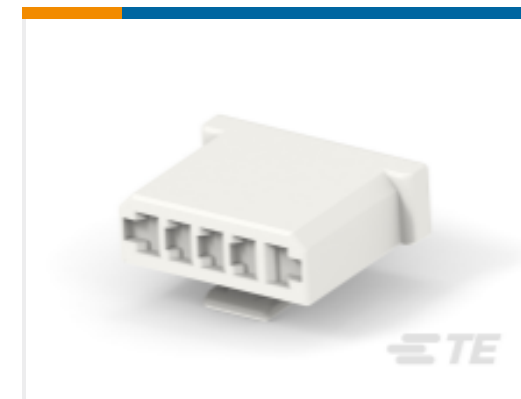
TE Part # 880192-1 5W FASTIN-ON REC. H